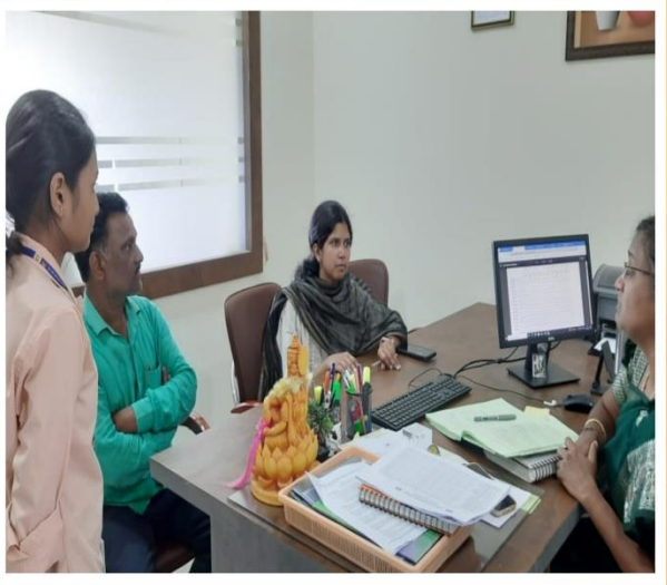
Department of CSE Organized "Parent Teachers Meet" for II & III Years On 29-04-24